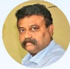
Sh. Mukesh Shukla (IAS) Commissioner Higher Education Govt. of M.P. Bhopal